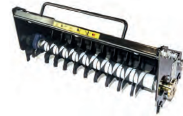
Scarifier with Tungsten tipped blades