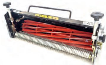
10 bladed cylinder with groomer