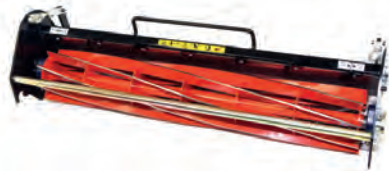
8 bladed cylinder