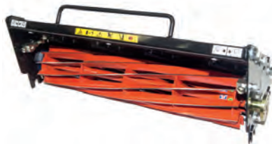
10 bladed cylinder