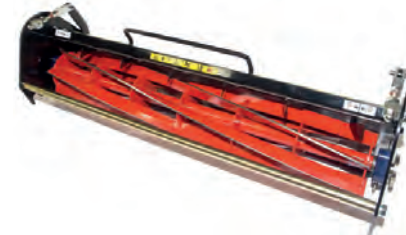
6 bladed cylinder