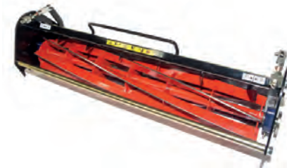
6 bladed cylinder