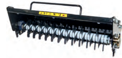
Scarifier with Tungsten tipped blades