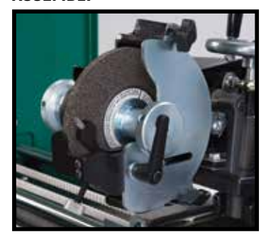
J DUAL INDICATOR SET-UP GUAGE